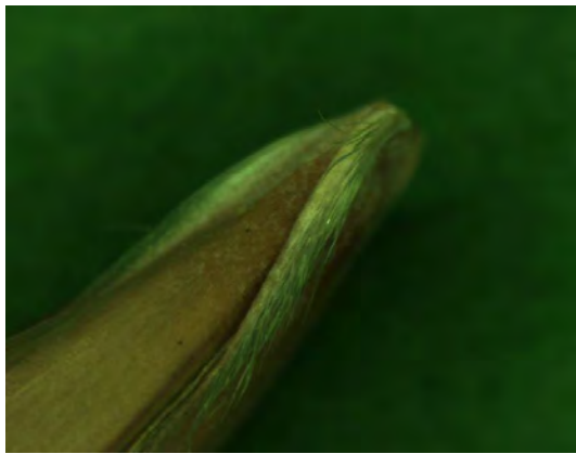
Figure 9. Glume hairs: 3=long