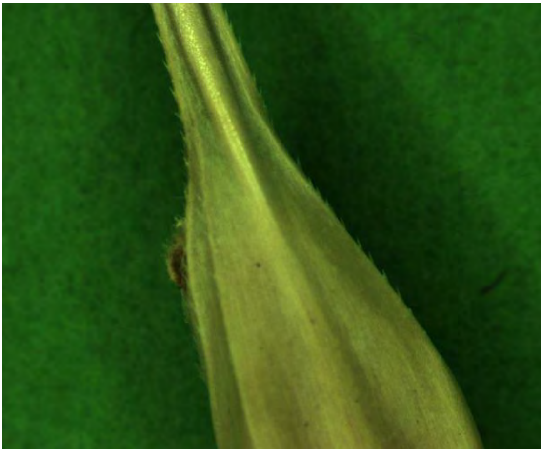
Figure 10. Lemma Teeth: 3=numerous