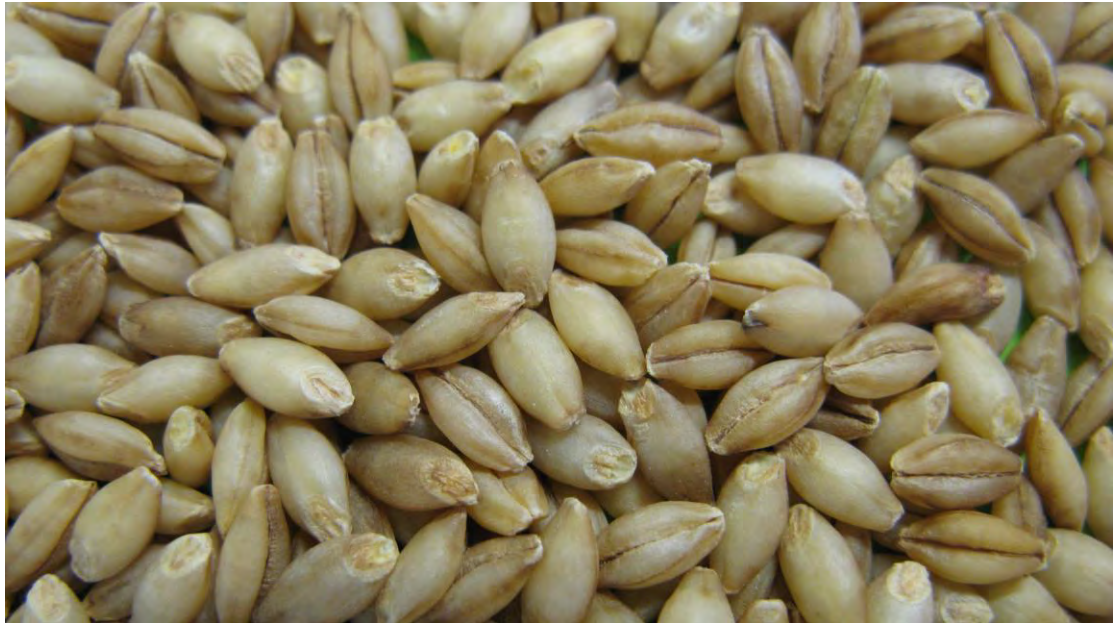
Figure 6. Variety 'Kornelija' grain