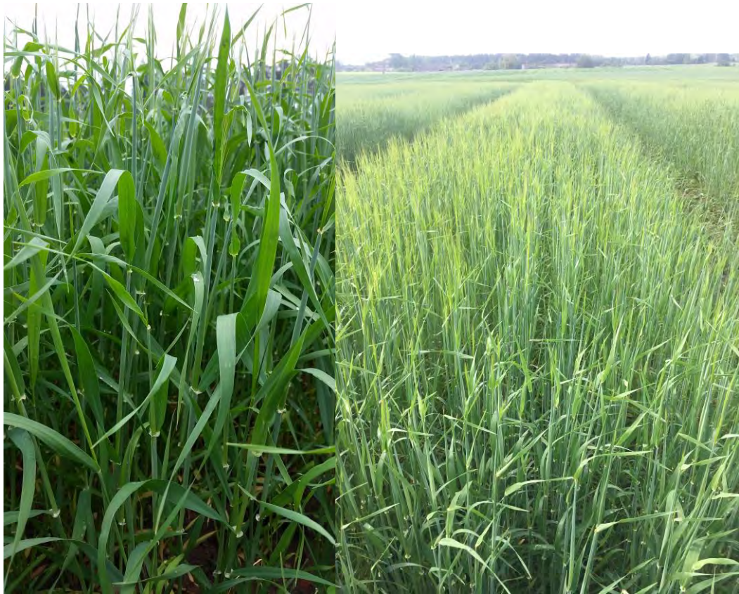
Figure 1. Variety 'Kornelija' at boot stage to beginning of heading stage