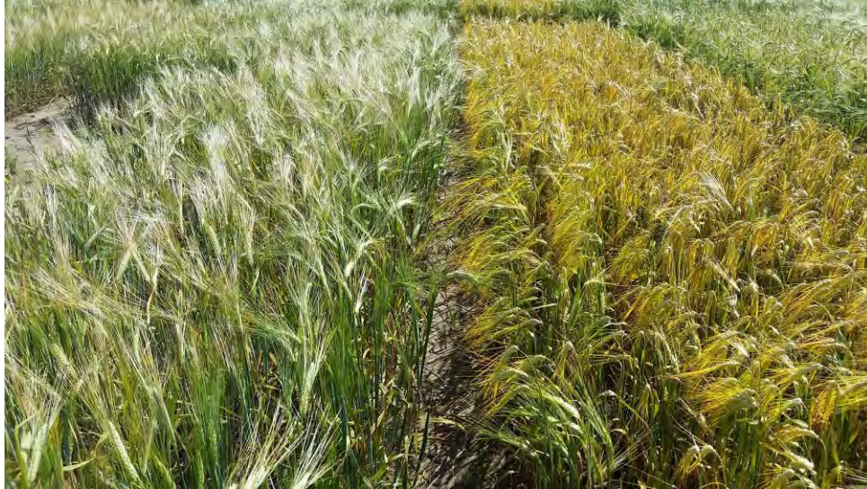
Figure 3. Hulless barley varieties: 'Irbe' (on the left) and 'Kornelija' (on the right).