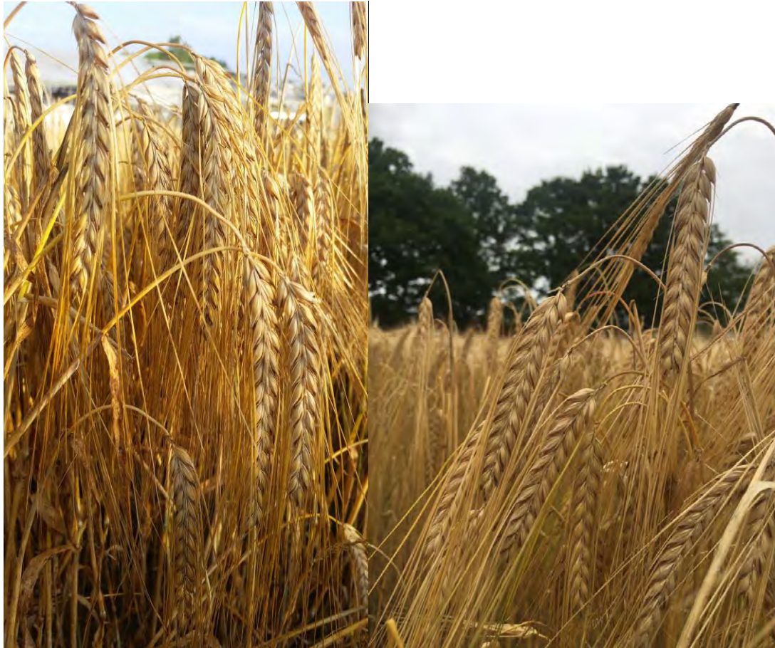
Figure 5. Variety 'Kornelija' ears in full ripening, before harvesting