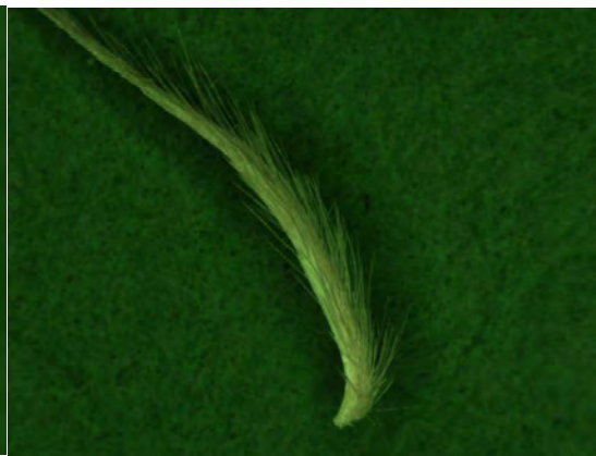
Figure 10. Glume Hair covering: 4=Completely Covered