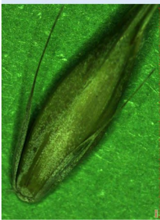
Figure 8. Glume length: 1= 1/2 Lemma