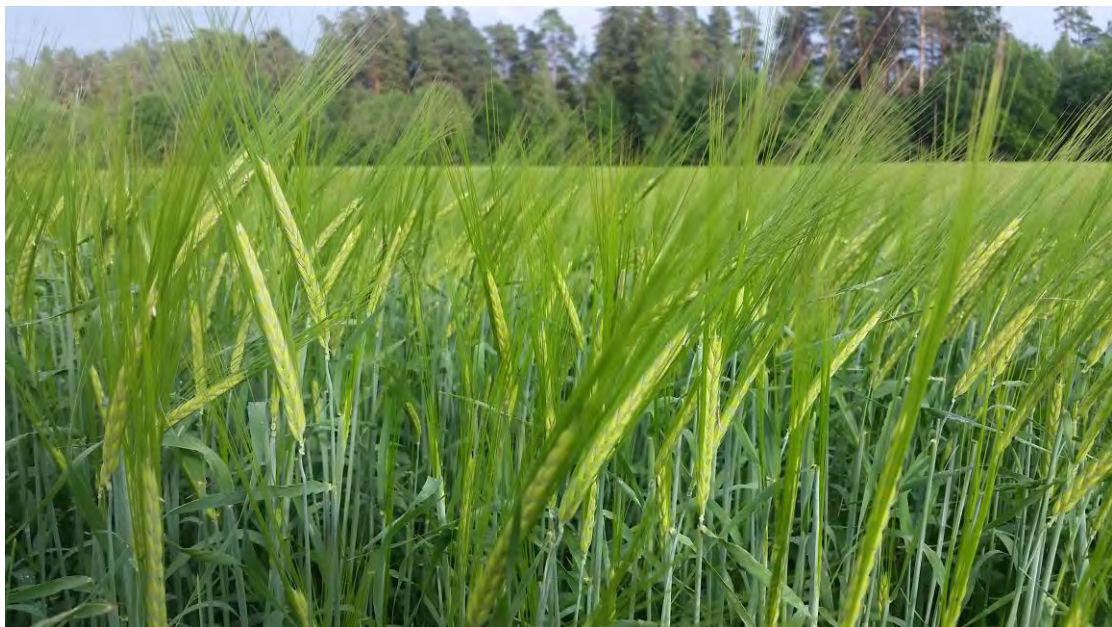
Figure 2. Variety 'Kornelija' in the beginning of grain filling