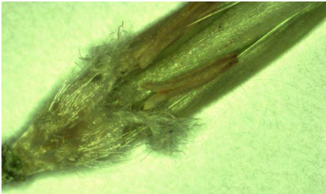
Figure 13. Hairs: 2= Many