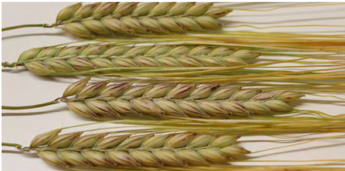
Figure 6. Variety 'Kornelija'. Anthocyanin coloration of nerves of lemma: medium to strong