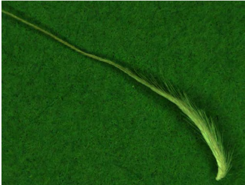
Figure 11. Glume awns. 3=More than Equal to Length of Glume