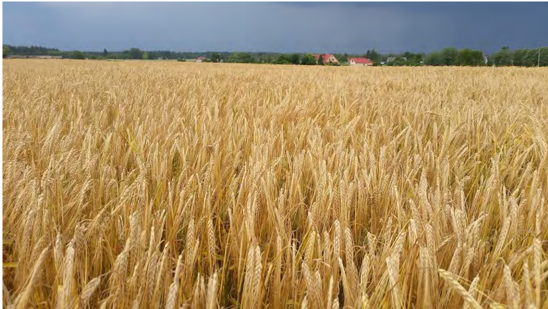
Figure 4. Variety 'Kornelija' sowing just before harvesting.